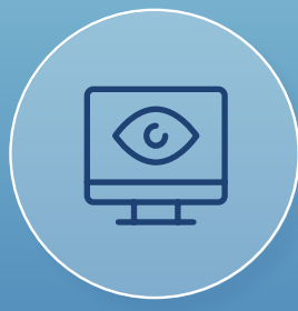
SECURITY AWARENESS TRAINING